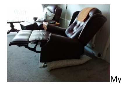
thoughts now are you can't prepare for every eventuality.

Safely deposited onto my wheelchair a great relief set in and we sat there in near silence as we didn't have a battery radio, 'it's on the 'to-do list'. Within half an hour the supply returned and the 'status-que' returned.